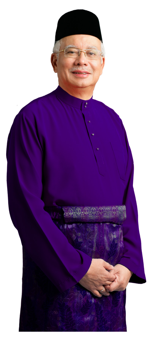
YAB Dato' Sri Mohd Najib Tun Haji Abdul Razak Prime Minister and Minister of Finance Malaysia